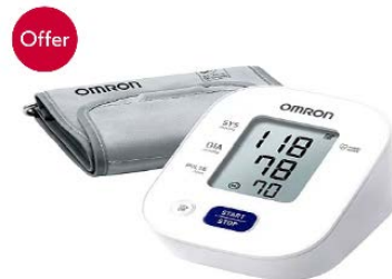
An inexpensive blood pressure machine

You can use this machine and the older machine located in the other end of the waiting room (blood pressure only), at any time when the surgery is open.