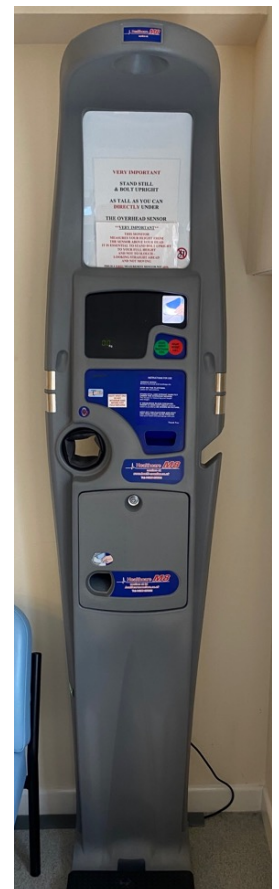
Our waiting room machine

Many of our patients have purchased their own inexpensive blood pressure machines (Boots online currently sell these for £31.99). If you use your own machine it is a good idea to record a number of results during the day, and calculate the average of the two readings it gives you (if you can remember your maths lessons!). You can submit readings to reception at any time and the results will be added to your notes.